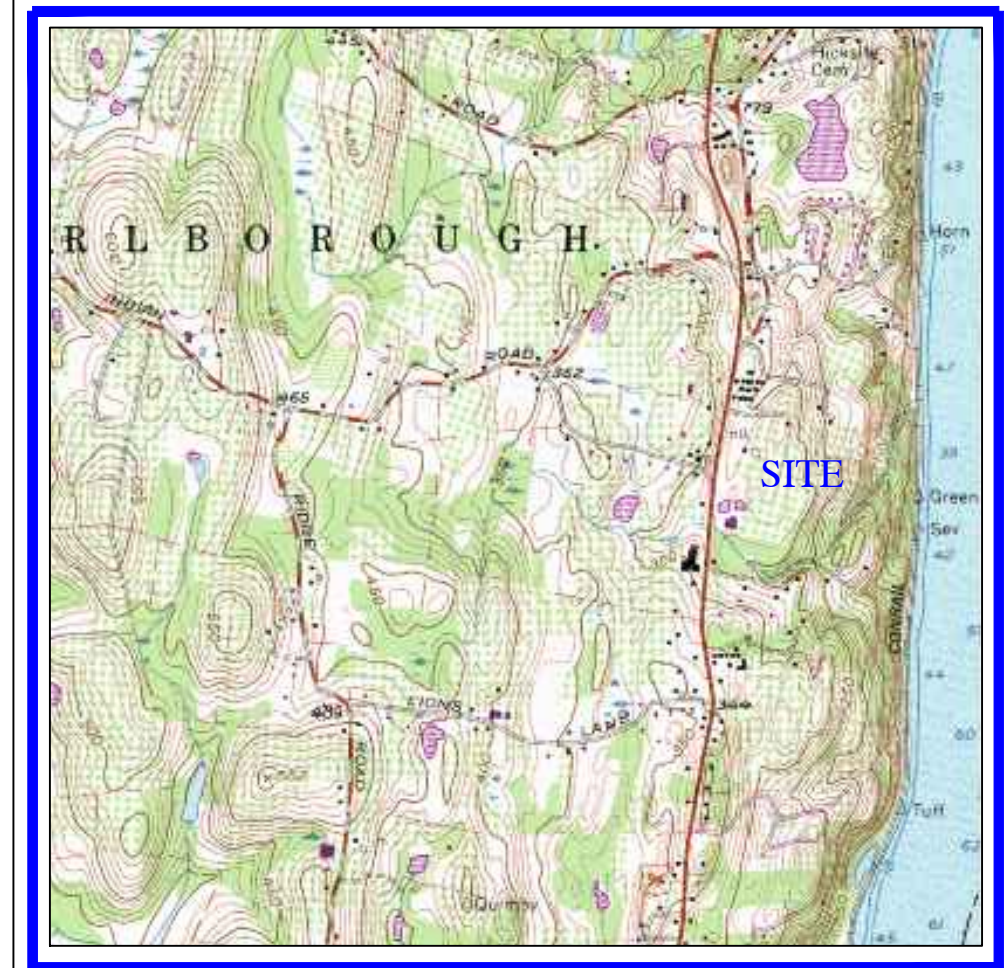
LOCATION MAP SCALE: 1" = 2000' USGS QUADRANGLE: POUGHKEEPSIE

Lands of The Hepworth Family Limited Partnership Deed Liber 5243 Page 170 UCCO FM #05-1489 SBL:103.3-3-13,112