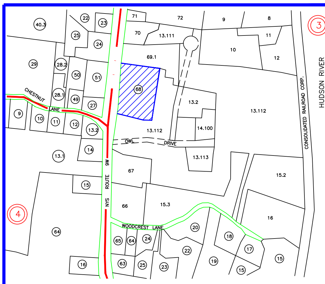
SECTION: 103.3, BLOCK: 3, LOT: 68 TAX MAP SCALE: 1" = 600'