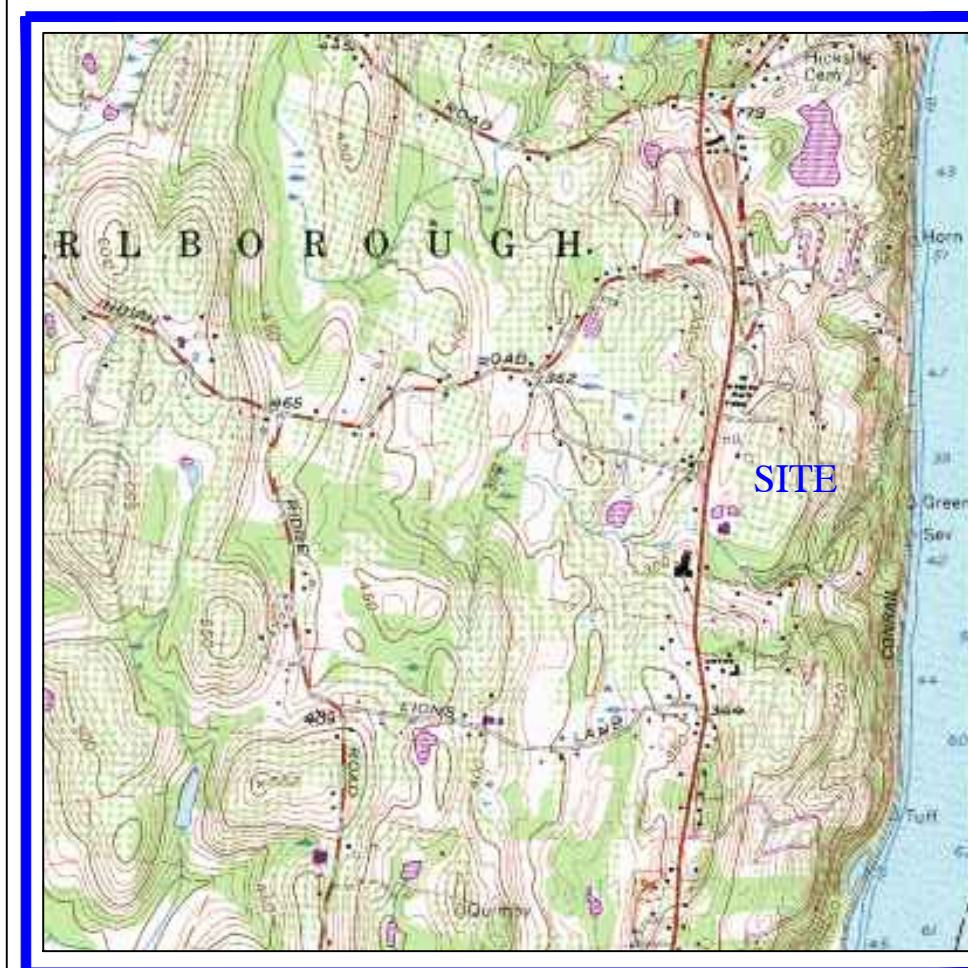
LOCATION MAP SCALE: 1" = 2000' USGS QUADRANGLE: POUGHKEEPSIE

Lands of The Hepworth Family Limited Partnership Deed Liber 5243 Page 170 UCCO FM #05-1489 SBL:103.3-3-13.112