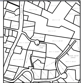
AREA 7 LOCATION MAP 1"=400'