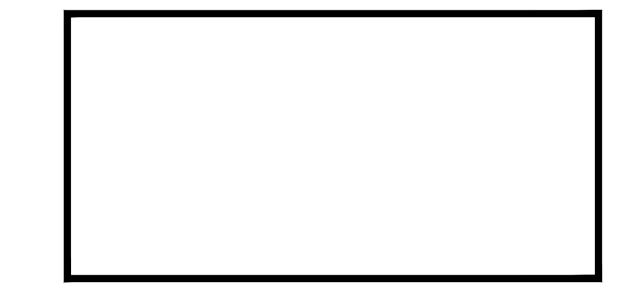
TABLE OF POSSIBLE ENCROACHMENTS WIRE FENCE PARKED TRAILERS NOTE: THESE ARE THE POSSIBLE ENCROACHMENTS OBSERVED DURING THE PROCESS OF CONDUCTING THE FIELD WORK. THERE MAY BE OTHERS NOT RECOGNIZED BY THE SURVEYOR.