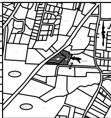
AREA 1 LOCATION MAP 1"=600'